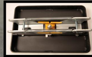
Bottom View of Lid in Locked Position – Pick Holes Blocked